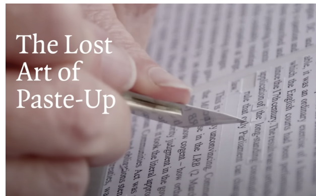
The Lost Art of Paste-Up